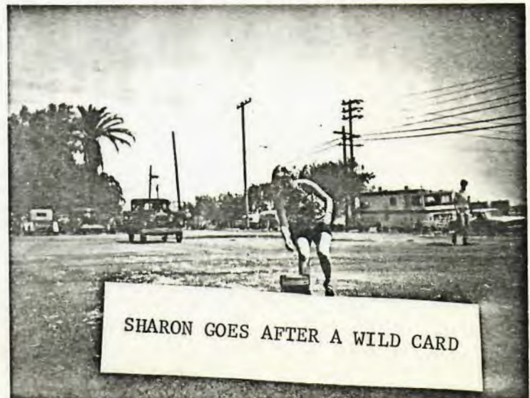
SHARON GOES AFTER A WILD CARD